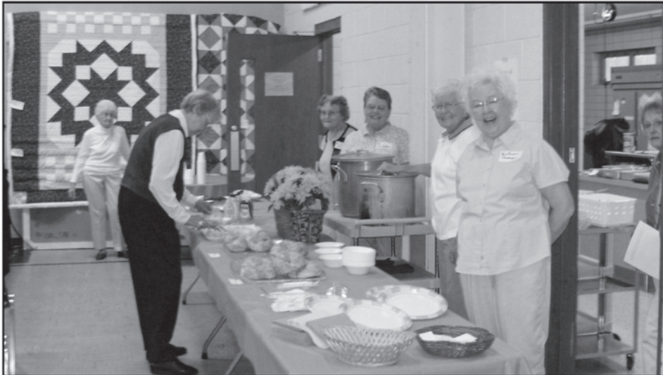
Richfield Lutheran's Naomi Circle members volunteered to prepare and serve the Quilt Auction luncheon. Pictured in the background are two of the many beautiful, handcrafted quilts in the auction. The large-star pattern quilt on the left was among the top three quilts bringing in the highest bids. See article below for more information.

Myriad hours were spent creating the record 118 items auctioned at Richfield