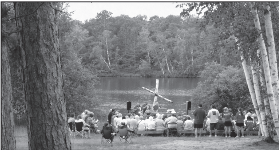
Worship on The Point is always an inspiring and popular part of the Summer Open House, and this year was no exception. It was a sunny summer day, perfect for gathering on the lakeshore of a small bay on Lake 26, where Luther Park resides.

Another great turnout of friends and volunteers for Luther Park contributed to making Summer Open House a festive success. It was a very full day for all!