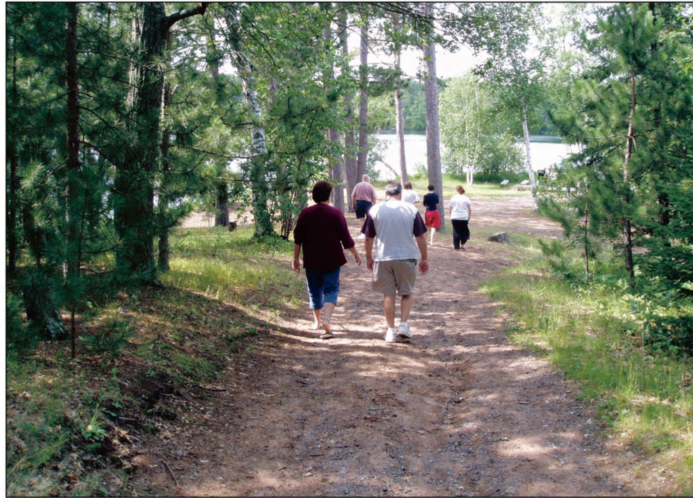
↑ Retreaters and campers are shown on the pathway to worship on The Point at Luther Park.