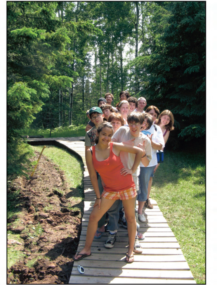
↑ Great Lakes Mission Trip participants from Richfield Lutheran Church posed on the boardwalk they completed at Camp Amnicon.