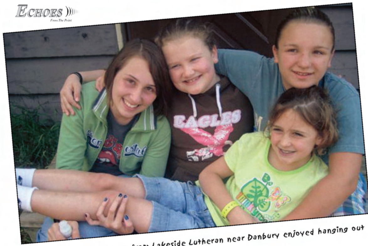
↑ Happy Week 5 campers from Lakeside Lutheran near Danbury enjoyed hanging out with their friends at camp.